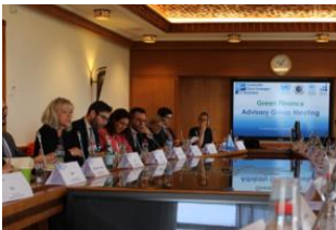
Green Finance Advisory Group Meeting Geneva, Switzerland

Four consensus building events with over 200 participants