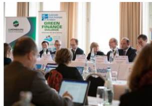
Green Finance Dialogue COP23 Bonn, Germany