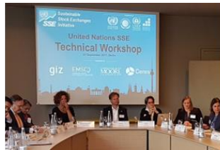
SSE Technical Workshop Berlin, Germany