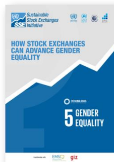
Guidance on Gender Equality