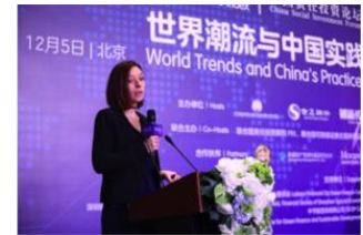
China Social Investment Forum Week Beijing, China