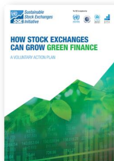
Guidance on Green Finance