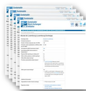
Ninety Fact Sheets maintained