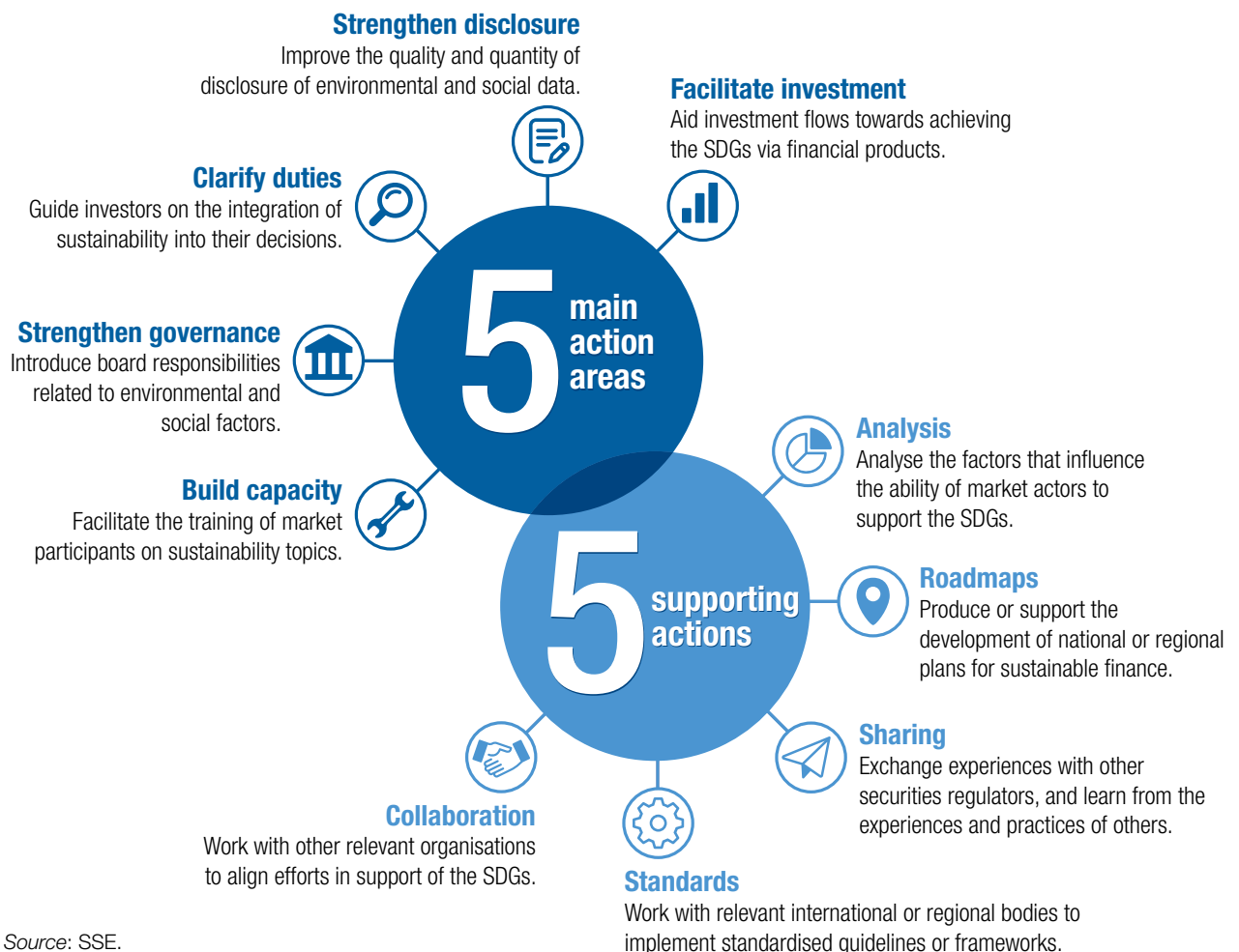
Figure 1 How securities regulators can support the SDGs: an action plan