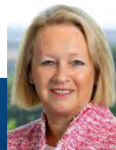
Mary L. Schapiro

These challenges are not to be dismissed. Rather, they are overshadowed by the costs of inaction — not only in terms of financial capital, but also long-term human and ecological well-being. To successfully engage a broad spectrum of investors and direct capital to where it can make its most significant contributions to the SDGs, securities regulators need not be motivated by their values alone. Like the SEC was in 2010, they can — and, indeed, should — be driven by their responsibility to investors and to the stability and resilience of the markets they serve.