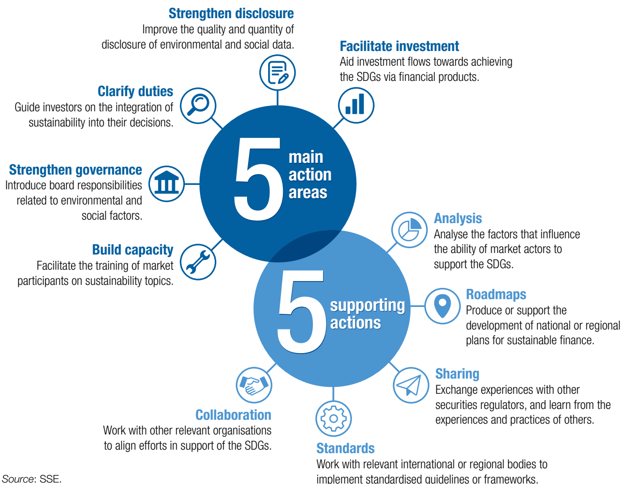
Figure 1 How securities regulators can support the SDGs: an action plan